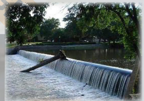
The Alden Dam on the Iowa River, in Alden, IA where two canoeists died on April 29, 2007.

Tragedies like this can be avoided if certain precautions are taken. The canoeists did the right thing by exiting the river upstream of the dam and portaging around it. However, they re-entered the river too close to the dam.